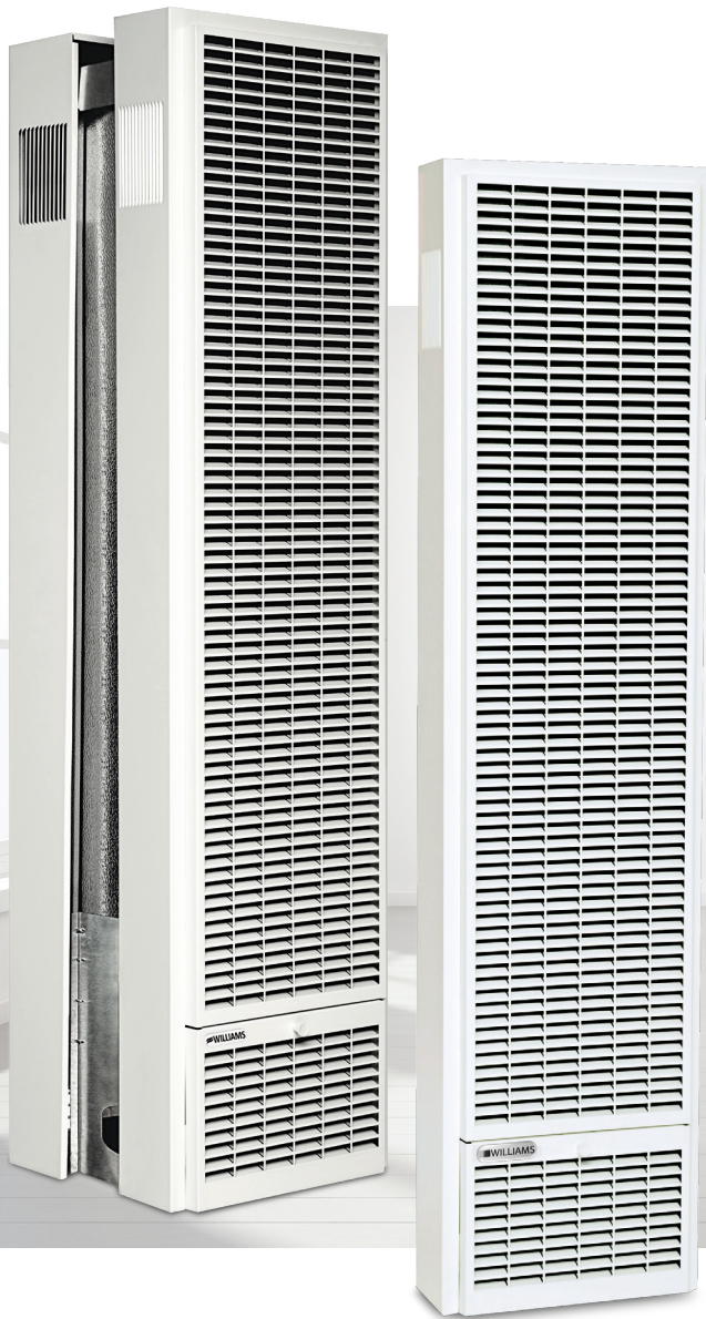
DUAL-WALL TOP-VENT 50,000 BTU/hr.